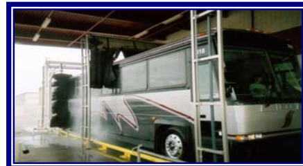
Rieskamp Washing Systems' Bus wash system

4370 MALSARY ROAD · SUITE 200 · CINCINNATI · OHIO · 45242 PHONE: 513-731-6350 · TOLL FREE: 800-661-9443 · FAX: 513-731-0678 WWW.GALAXY-ASSOCIATES.COM / WWW.RIESKAMP.COM